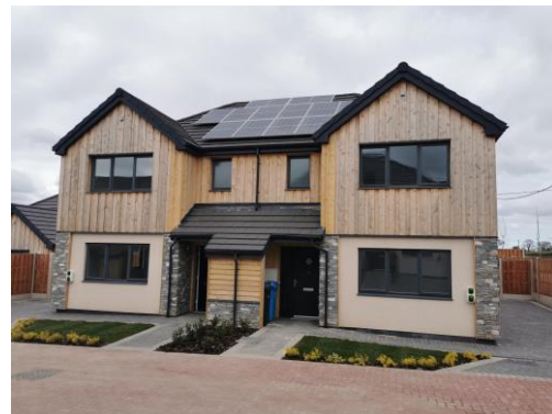
Figure 2: Clwyd Alyn scheme in Llanbedr DC