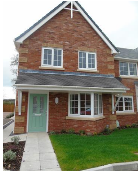
Figure 4: Dol Hyfryd, Denbigh Intermediate Housing Grŵp Cynefin

2.46 The Council is developing an Asset Management Strategy which includes a 30-year house building programme, and a maintenance programme which will incorporate the commitments the Council has made regarding achieving zero carbon status for emissions by 2030. It will also meet the Welsh Governments standards required regarding decarbonisation of existing Council stock.