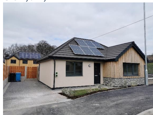
Figure 3: Clwyd Alyn scheme Llanbedr DC

2.13 All supply is influenced by planning policy, the viability of 'private' housing development to provide some affordable