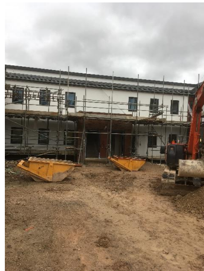
Figure 7: Awel Y Dyffryn, Denbigh Extra Care units under construction