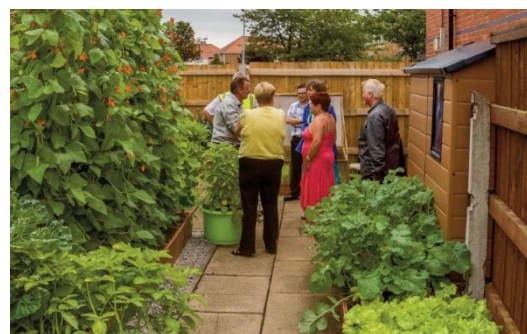
Buxton Court Community Garden

6.5 The success of Buxton Court led to Wales & West creating a Butterfly and Sensory Garden at their affordable housing and supported housing development at Cil Y Coed in Henllan. The residents were successful in gaining a grant from Cadwyn Clwyd and from Welsh Government. The garden forms part of a patchwork of five wildlife gardens in the area and work to ensure that they remain bee and butterfly friendly rather than just overgrown is undertaken by the residents who are part of the Henllan Conservation Group. The key for success in the two projects is that they have been resident led.