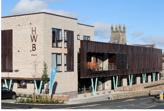
Figure 6: HWB Youth Homeless Accommodation & Training Centre Denbigh