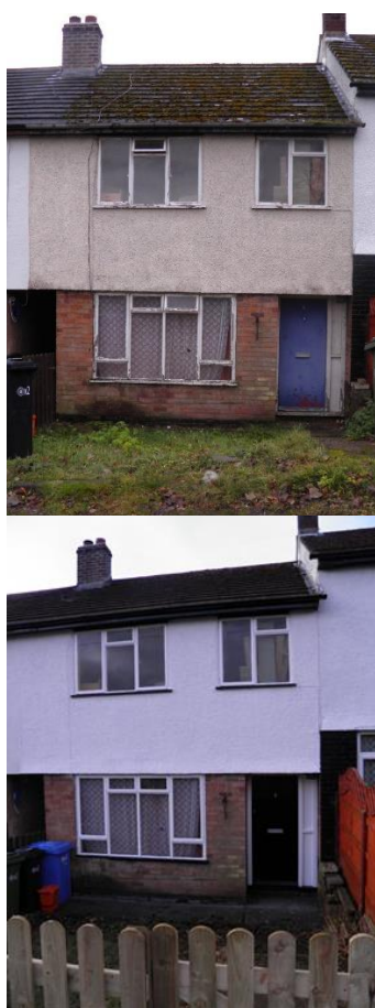
Figure 5: Private property improved through Enforcement action